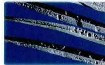
Underside of an infested palm frond.

*Tip: If you have many heavily infested plants, you can purchase professional strength, non-restricted use insecticides. This may be more cost effective compared to the homeowner version of systemic insecticides. Or hire a professional landscape pest control company with experience controlling whiteflies in the landscape.