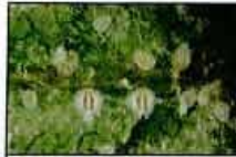
Whitefly immature stages

from the eggs and crawls around before it starts to feed with its "needle-like" mouthparts. This stage is very small and difficult to see.