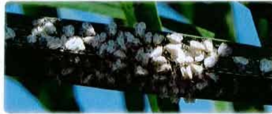
Adults on the underside of a palm leaflet.

But DON'T panic. This whitefly is different from the ficus whitefly. So far, the Rugose Spiraling Whitefly is not causing severe plant damage such as plant death or severe branch die-back.