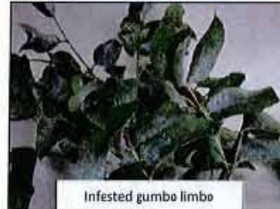
Infested gumbo limbo