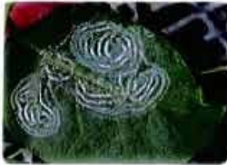
Eggs are laid in spirals.

But DON'T panic. This whitefly is different from the ficus whitefly. So far, the Rugose Spiraling Whitefly is not causing severe plant damage such as plant death or severe branch die-back.