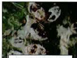
Parasitized whitefly pupae