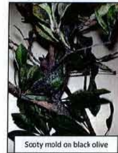
Sooty mold on black olive

Management in the Landscape: Often, when new pests arrive, they can reach very high populations and can be extremely damaging. It is not uncommon, however, that after several years, the impact is greatly reduced. Although it may be necessary to use insecticides for this pest, it is very important to understand the importance of natural enemies and the need to focus on long-term, biologically based management.